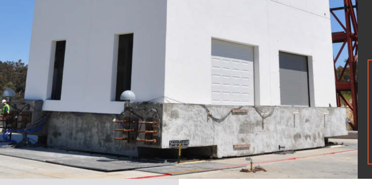
PHOTO: The University of California, San Diego, has a $250,000 grant to research Precast Concrete Cladding Subsystems—Detailing for Regions of High Seismicity. The purpose is to understand experimentally the effects of dynamic loading on precast concrete cladding façade systems, and to allow a new realistic assessment of the performance of the concrete cladding, its steel connections, and punch-out windows.