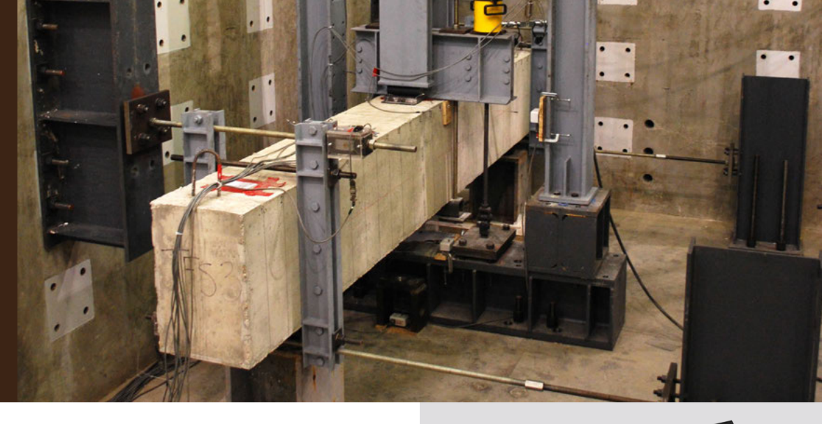
PHOTO: The University of Cincinnati is researching Continuous Stirrups for Shear and Torsion Reinforcement in Beams, with a $114,000 grant. This project will evaluate the behavior and capacity of continuous stirrups as shear and torsion reinforcement, as well as confinement steel, and will formulate design and detailing provisions for continuous stirrups.