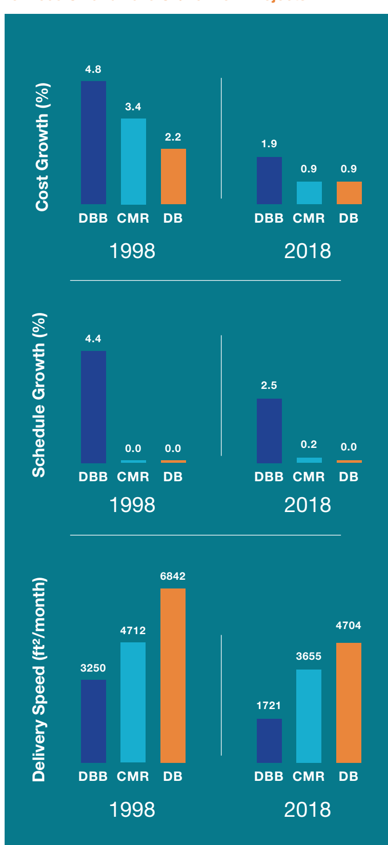
Figure 1: Median Performance Comparisons for 1998 CII and 2018 CII/Pankow Projects